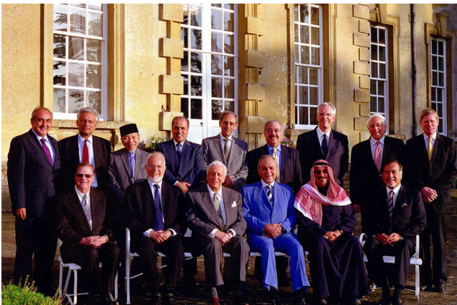
The Trustees of the Centre at Ditchley Park

The annual meeting of the Board of Trustees was held in September in Ditchley Park, Oxfordshire. The Board visited the site of the new building to view the progress achieved in construction over the past year and later