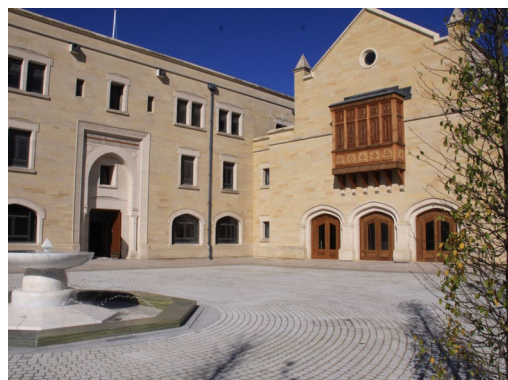
Istanbul Courtyard facing west

Alongside displays showing the way in which Turkish scholars, and leaders of opinion, have participated in, and supported,