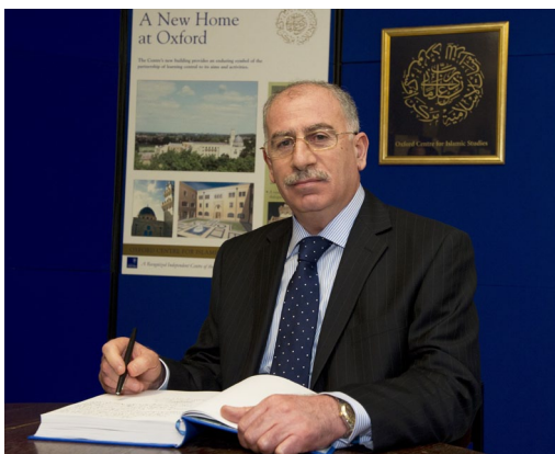
HE Mr Osama Al Nujaifi signing the visitor's book at the Centre's New Building.

HE Mr Osama Al Nujaifi, Speaker of the Iraqi Parliament, visited the Centre on 11 October. He visited the Centre's new building, delivered a lecture in the Examination Schools, and attended a dinner hosted by the Centre at Balliol College. He was accompanied by a large delegation of Iraqi Parliamentarians, representative of the great