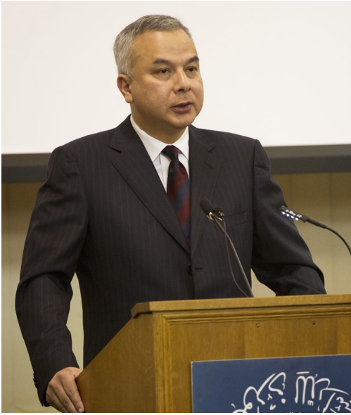
HRH Raja Dr Nazrin Shah speaking at the Examinations Schools

On 9 November the Centre hosted a lecture at the Examination Schools by newly appointed Trustee, His Royal Highness the Crown Prince of Perak, Raja Dr Nazrin Shah, entitled "Islam, Muslims and Human Rights".