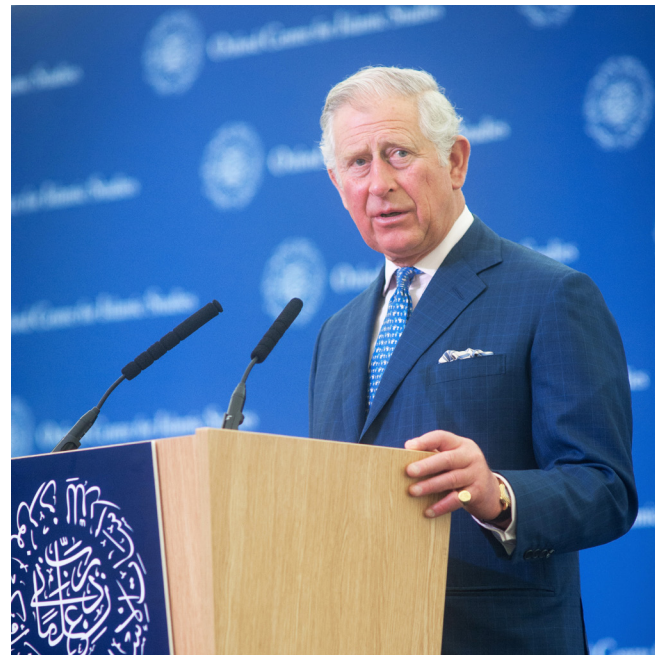
His Majesty King Charles III

King Charles III has demonstrated a steadfast commitment to fostering mutual understanding between the Islamic world and the West. His vision for the Centre has always emphasized the importance of education and intercultural dialogue as the means of bridging cultural divides. This vision supports the Centre's mission to promote scholarly excellence and foster community among scholars from diverse backgrounds.