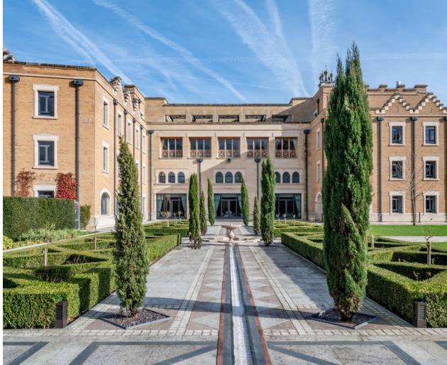
HM King Charles III Garden, formerly the Prince of Wales Garden

The Centre celebrates the confirmation of King Charles III's royal patronage with immense gratitude and optimism. His Majesty's enduring support has been pivotal to the Centre's growth and success, and his vision continues to inspire its mission and aspirations.